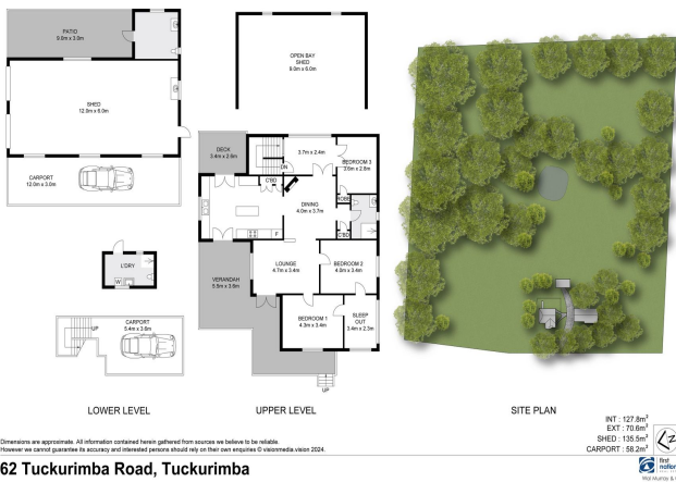
62 Tuckurimba Road, Tuckurimba INT - 127.8m 2 EXT - 71.0m 2 SHED - 135.5m 2 CARPORT - 58.2m 2