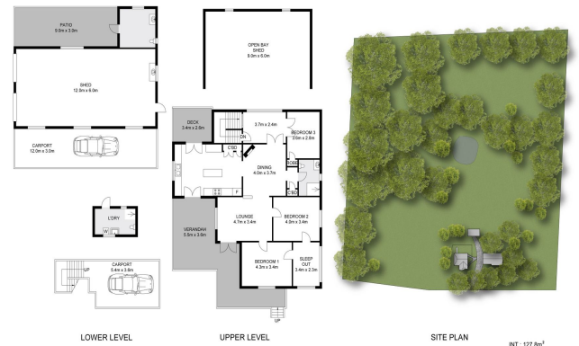
62 Tuckurimba Road, Tuckurimba INT - 127.8m 2 EXT - 71.0m 2 SHED - 135.5m 2 CARPORT - 58.2m 2